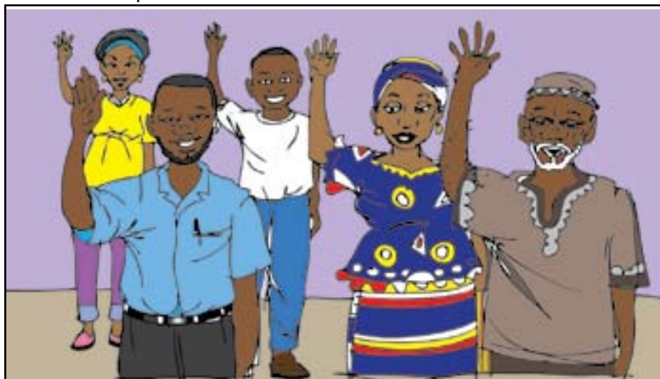
Nominate and elect/select members of the Interim Coordinating Committee.

ings (hunters group, minority groups, etc) and elders should be represented where possible.