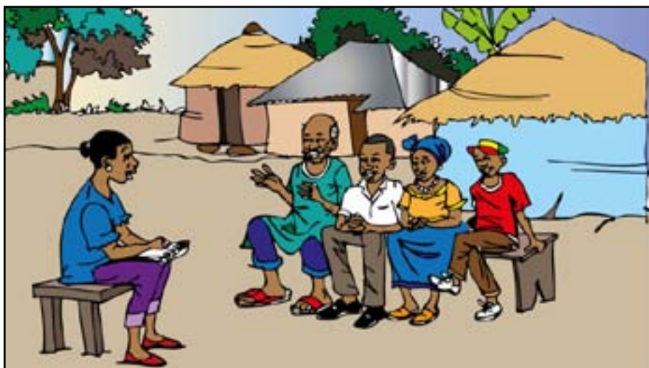
Conduct key informant interviews with key community members.

5.1.2 Conduct key informant interviews with key community members