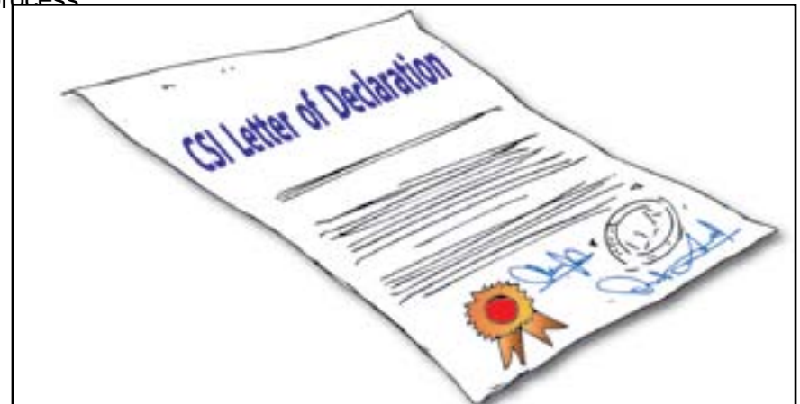
Signing of CSI declaration

Communication/letter indicating the completion of all activities of CSI process